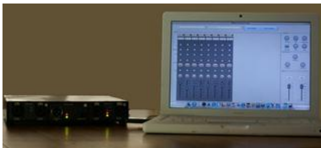
Grip FlexNet AV System eliminates consoles and cables!

Grip has reinvented professional audiovisual equipment from the ground up to deliver an enjoyable, effortless, and efficient experience allowing users to be more creative. Whether a house or monitoring engineer, artist, producer, or promoter, Grip's FlexNet AV System puts the power in your hands to create—and recreate—the system for your changing needs!